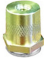
M6 - TPO6