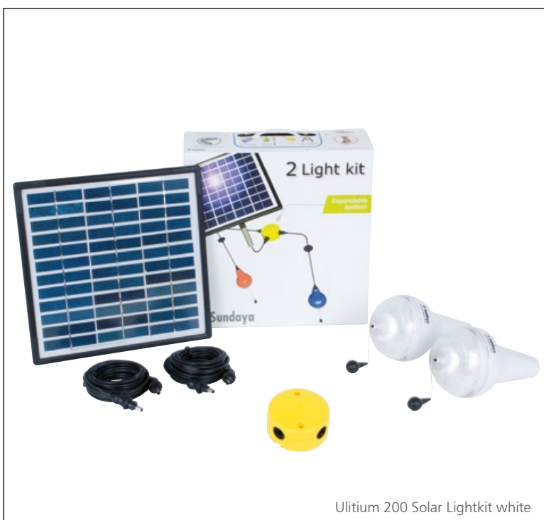
Ulitium 200 Solar Lightkit white