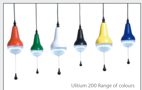
Ulitium 200 Range of colours