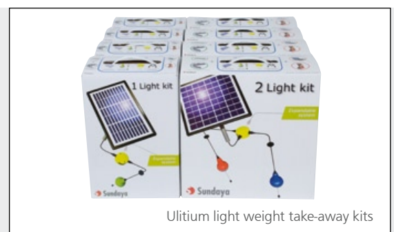
Ulitium light weight take-away kits