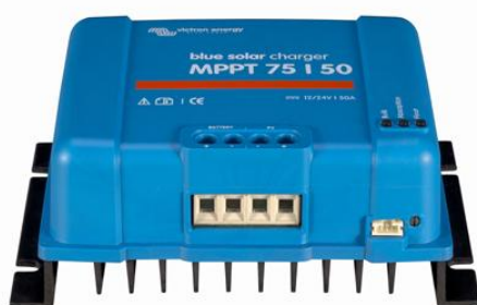
Solar charge controller MPPT 75/50