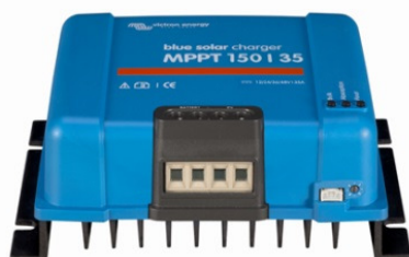
Solar charge controller MPPT 150/35