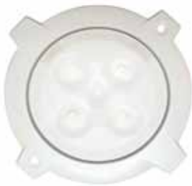
MEGALUX RECESSED (PD2)

Built in PIR sensor/switch option - The electronics used within the PIR sensor/switch version have been designed to detect the movement of body heat to activate the sensor. Once the sensor has been triggered, the unit will switch on for 5 minutes before automatically switching off, preventing any unnecessary load, thereby extending battery life. If continuous movement is detected then the lights in the vehicle will remain on.