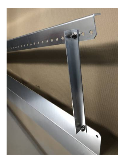
Rear strut fixing