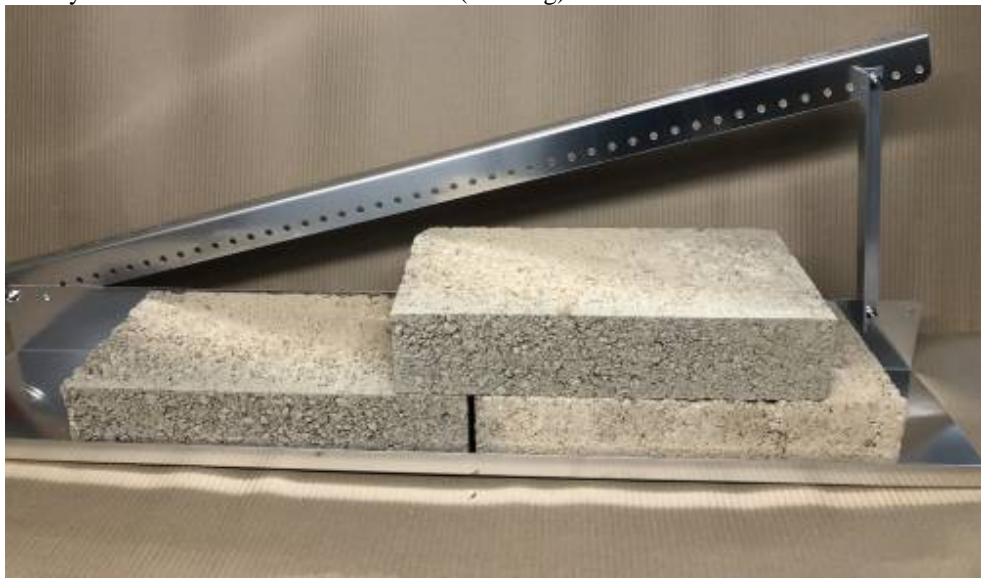
Wickes part No. 166860 Travis Perkins Part No. 700064

For the ballast to be used with the R type structure kit, it is suggested that you use high density concrete blocks 440x215x100mm (17-18kg).