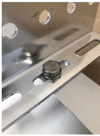
M8 module fixing