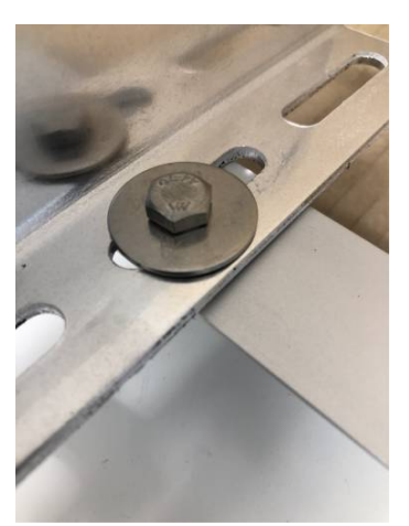
M6 Module fixing with penny washer