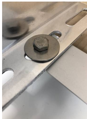
M6 Module fixing with penny washer