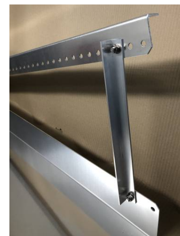
Rear strut fixing