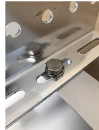
M8 module fixing